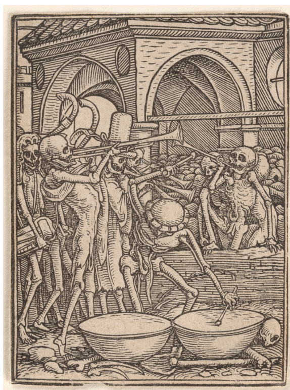
Skeletons Making Music (or the Cemetery), from The Dance of Death Artist: Designed by Hans Holbein the Younger (German, Augsburg 1497/98–1543 London) Printmaker: Hans Lützelburger (German, died Basel, before 1526) Date: ca. 1526, published 1538 Medium: Woodcut