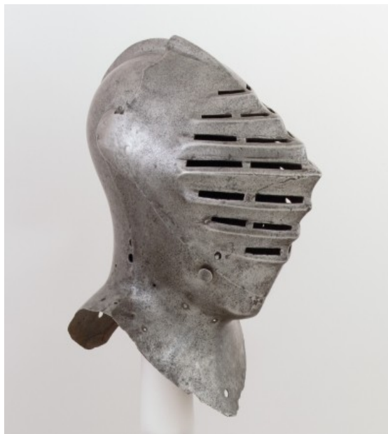
Tournament Helm Anglo-Flemish