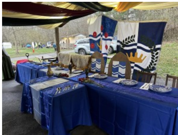
High Table (before the high winds)