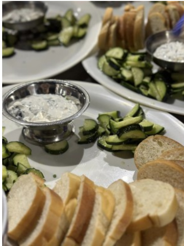
The art of cookery – and photography