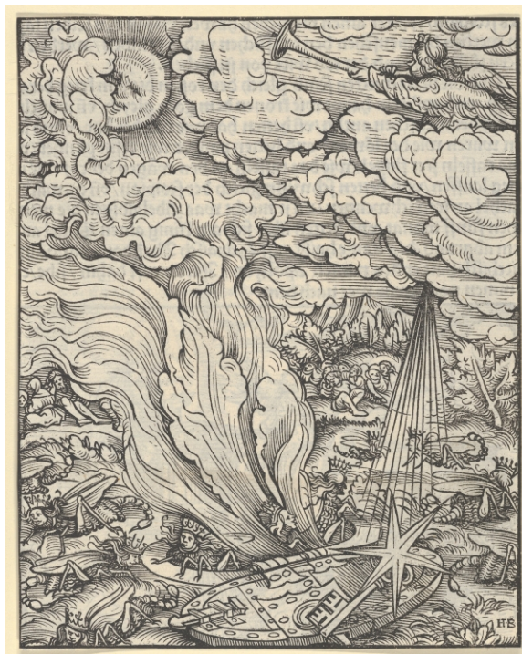
Recto of Sheet with Scene of The Fifth Trombone, from The Apocalypse 1523–24 Hans Burgkmair German

Plate 8 from a series of 21 woodcuts with scenes from the Apocalypse for Martin Luther's translation of the New Testament. Four editions were published in Augsburg by Silvan Otmar between March 1523 and April 1524.