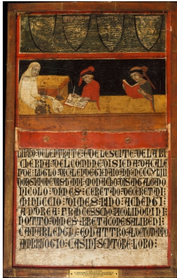
Book Cover, Artist: Italian (Sienese) Painter (dated 1343), Medium: Tempera on wood

This is the January, 2021 issue* of the Drekkar, a publication of the Barony of Storvik of the Society for Creative Anachronism, Inc. The Drekkar is available from Moe Lane at chronicler@storvik.atlantia.sca.org . Subscriptions are free as all publications are available electronically. This newsletter is not a corporate publication of the Society for Creative Anachronism, Inc., and does not delineate SCA policies.