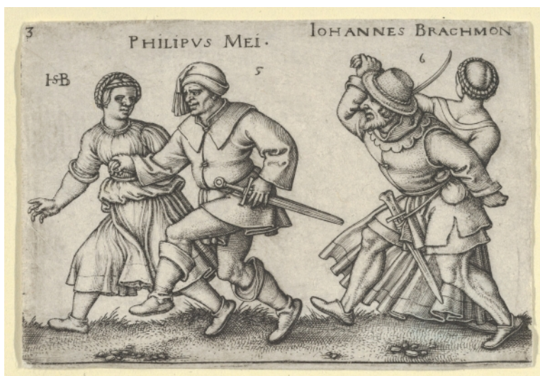
May and June from The Peasants' Feast or the Twelve Months 1546–47, Sebald Beham German