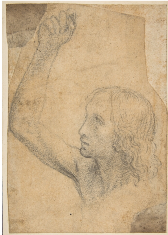
Youth with Right Arm Raised in a Shoulder-Length Portrayal (preparatory study for St. Sebastian), Timoteo Viti (Italian, Urbino 1469–1523 Urbino), ca. 1515. Soft black chalk, or charcoal, on paper now very darkened (to beige color)