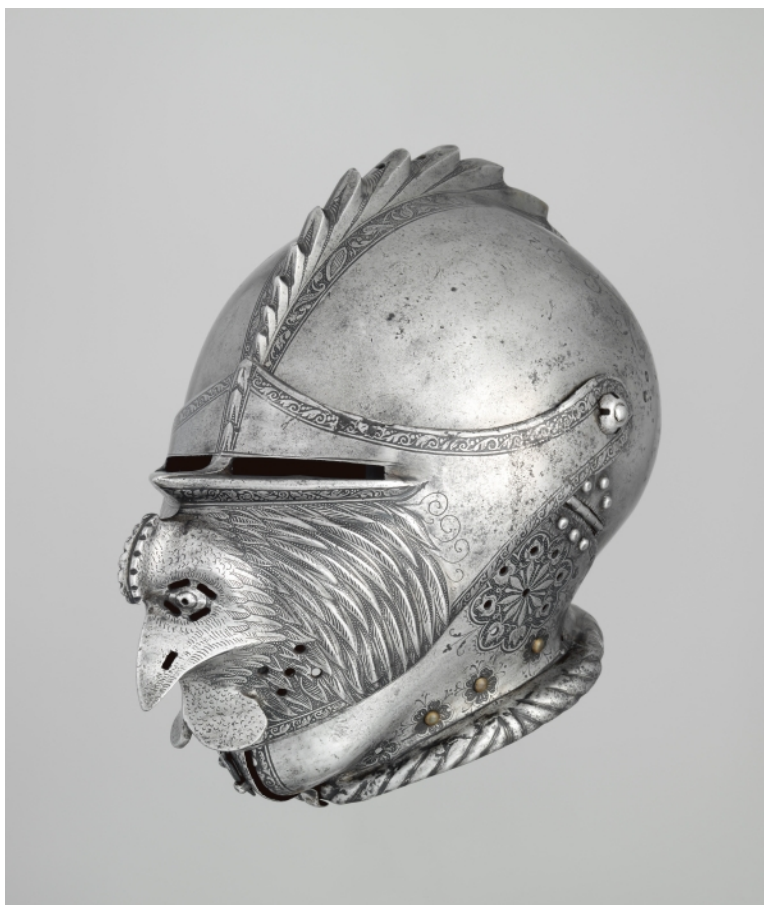
German Armet with Mask Visor in the Form of a Rooster, ca. 1530

...To quote the philosopher: do I even NEED a reason?