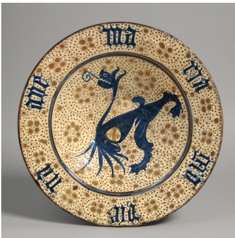
Dish, 1425–1450, probably Manises, Valencia, Spain Medium: Tin-glazed earthenware