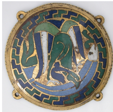
Eagle Attacking a Fish (one of five medallions from a coffret) ca. 1110–30, French

A 'Coffret' is a small box, by the way*.