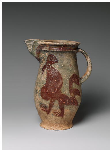
Barrel-Shaped Jug with a Fox and a Rooster (late 13th century French Glazen Earthenware)