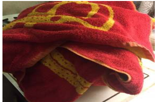
Skyr Pot wrapped in towels.

Take two tablespoons (or so) of culture and mix thoroughly with approximately two cups of the cooled milk. Incorporate the cultured mix back into the pot of milk and wrap the entire pot securely in blankets or towels to allow it to incubate.