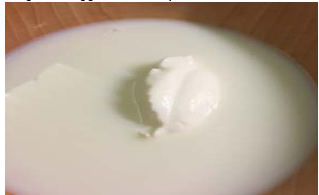
Skyr culture before mixing into the cooled milk

batch to incorporate into the new batch. You can buy existing skyr product (usually found in the dairy section as Icelandic yogurt), which is a safer means of procuring a culture. If you were a 9 th century Viking making skyr and your culture dried up or was unusable, I'm sure you could borrow a cup of skyr from, say, your neighbor Siggie to restart yours. 3