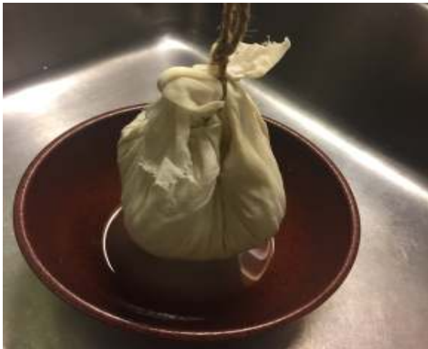
Skyr, in linen, suspended and draining a-whey. (I had a lot more whey puns but ran out of room)

Pour contents into a clean piece of linen over a basket or strainer and allow to drain. You can also tie up the ends of the linen and allow gravity to drain the whey out. At this point, you will want to remove approximately 1/4 cup of skyr to use for your next batch. .