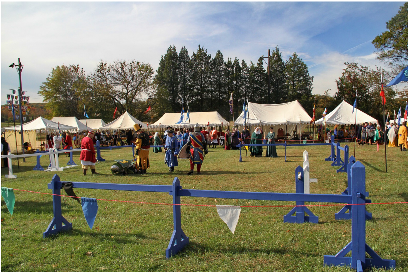
Storvik hosts Fall Crown Tournament, November 4, 2017.