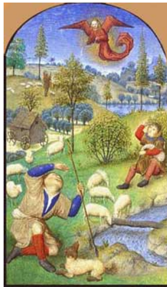
Figure 2: Trivulizo MS.

In the Trivulizo Manuscript, Book of Hours, by Simon Marmion in the late 15 th century, I found another depiction of the Annunciation of the Shepherds. Here, there are two men, looking up at an angel in red with a third man far in the background. Between the man in the lower left hand corner and the man far in the background is another house on wheels. These are clearly five spoke wheels and the house is shown to have windows – one high one in the back and one on the side visible to us.