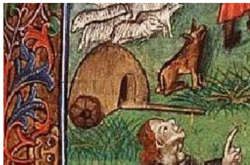
Figure 4: Small hut-shaped wheeled house

Not all shepherd's huts were house shaped, however. In a Book of Hours from 1465 (The Hague, KB, 76 G 14, fol. 49r), there is a small rounded shepherd's hut on two spoked wheels. You may view this image here ; a crop of the hut is seen in Figure 4.