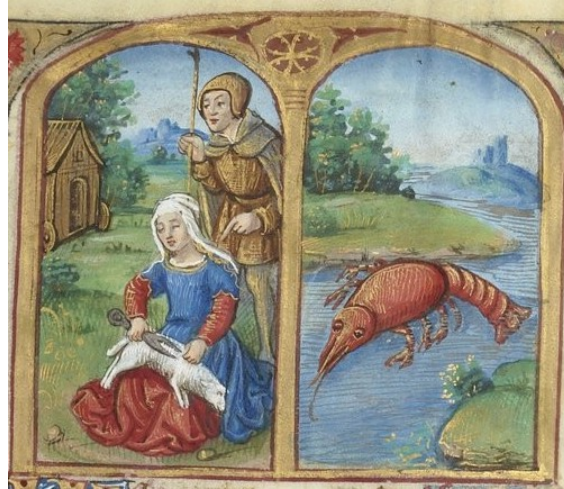
Figure 3: de Guise Book of Hours

In an early 16 th C Book of Hours believed to have been owned by Claude de Guise, there is a small image of a woman sheering a sheep with another shepherd behind her. In the left hand side of the image, there is another house on wheels with a door at the front. There is also a small window above the door. This is shown in Figure 3, below; you may view the entire image here .