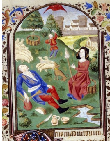
Figure 1: Ms. Rawl. liturg. f.13, 36v

In the Trivulizo Manuscript, Book of Hours, by Simon Marmion in the late 15 th century, I found another depiction of the Annunciation of the Shepherds. Here, there are two men, looking up at an angel in red with a third man far in the background. Between the man in the lower left hand corner and the man far in the background is another house on wheels. These are clearly five spoke wheels and the house is shown to have windows – one high one in the back and one on the side visible to us.