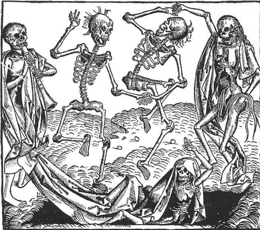
"Dance of Death" by Michael Wolgemut, 1493.