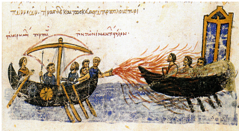
John Skylitzes, Synopsis of Histories , in the 12 th cen. MS Madrid Skylitzes