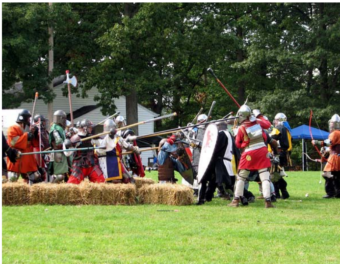
Bridge battle at Siege of Glengarry, Aethelmearc, 10/27/08

Baron and Baroness At Home: March 4 (7-11pm) Business Meeting: March 8 (7 pm) Dance Practice: March 2, 9, 16, 23, 30 (8-10pm) EGGS: Mar. 5, 19, Apr. 9, 23 (7-9pm) Fight Practice: March 2, 9, 16, 23, 30 (7-9:30pm) Music Ensemble: March 10, 24 (7-9pm) Newcomers' Night: March 11 (7:30-9pm) Scriptorium: March 18 (7-9pm)