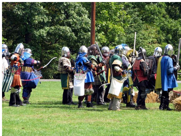
Atlantian fighters and archers at Siege of Glengarry, Aethelmearc 10/27/09