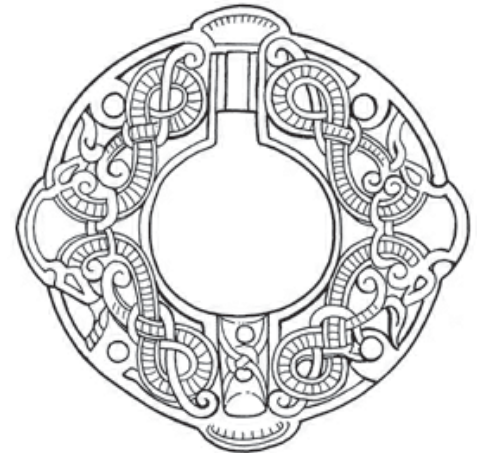
Base Plate of Drum Brooch, Tandgarve, Sweden.