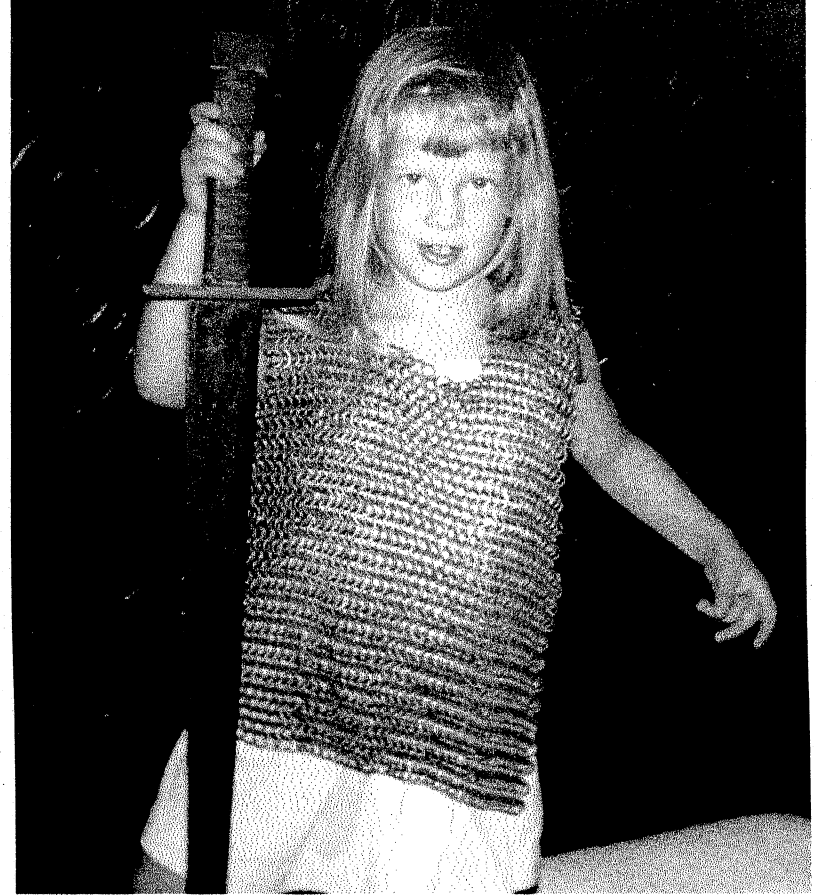
Viking Queen in Training (See Page 12)

July 2005, A.S. XXXIV Volume 20, Issue 4