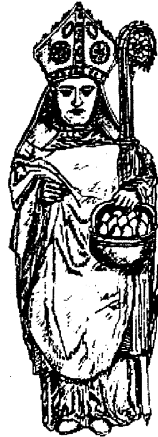
July 2, 862: St. Swithun dies