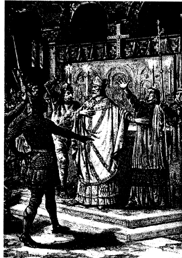
December 29, 1170: Thomas Becket murdered in Canterbury Cathedral