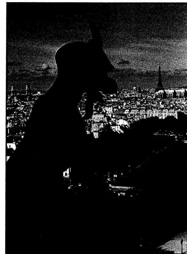
Gargoyle atop Notre Dame Cathedral