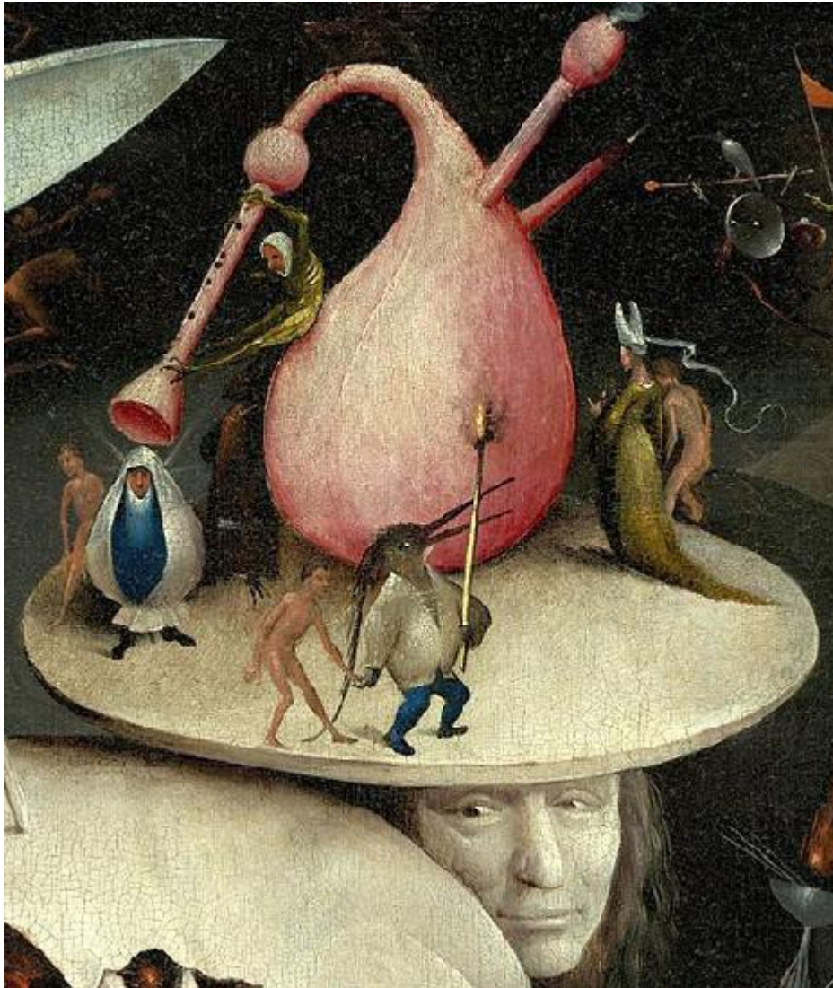
Detail from The Garden of Earthly Delights , Hieronymus Bosch , c. 1500.

Despite looking like something by Salvador Dali, this is period. It's part of a famous triptych; this detail is from a panel showing Hell and the torment of souls there. One might assume the souls above are being made to dance eternally by their demonic partners, possibly as punishment for such frivolity in life. The triptych is rich with symbolism, much of it obscure, and trippy enough to make it a popular subject for college dormitory posters.