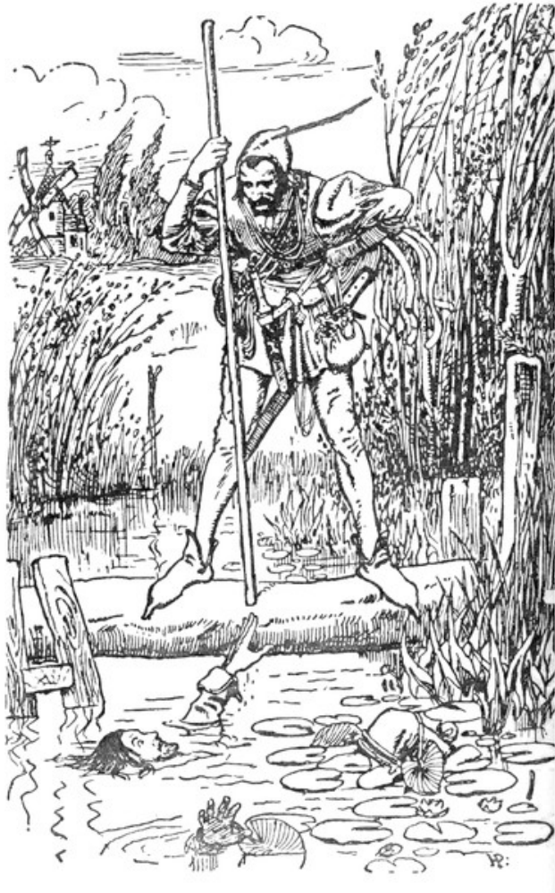
To the Victor Goes the Reservation! (Image: Howard Pyle, 1883)

Armed with smartphone and undaunted spirit, He swiftly hunted down more dates to fight for, More timely treasures for Great Storvik's coffers. And after mighty counsels with the foresters Did wrest a reservation in September!