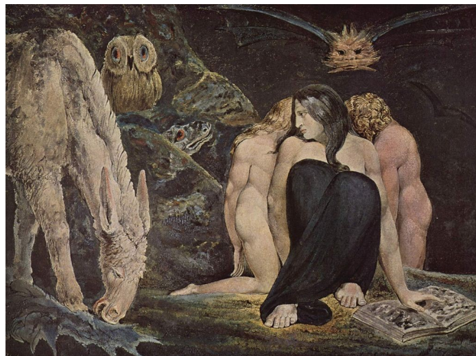
Hecate and her minions. (Image: "Triple Hecate," William Blake, 1795.)